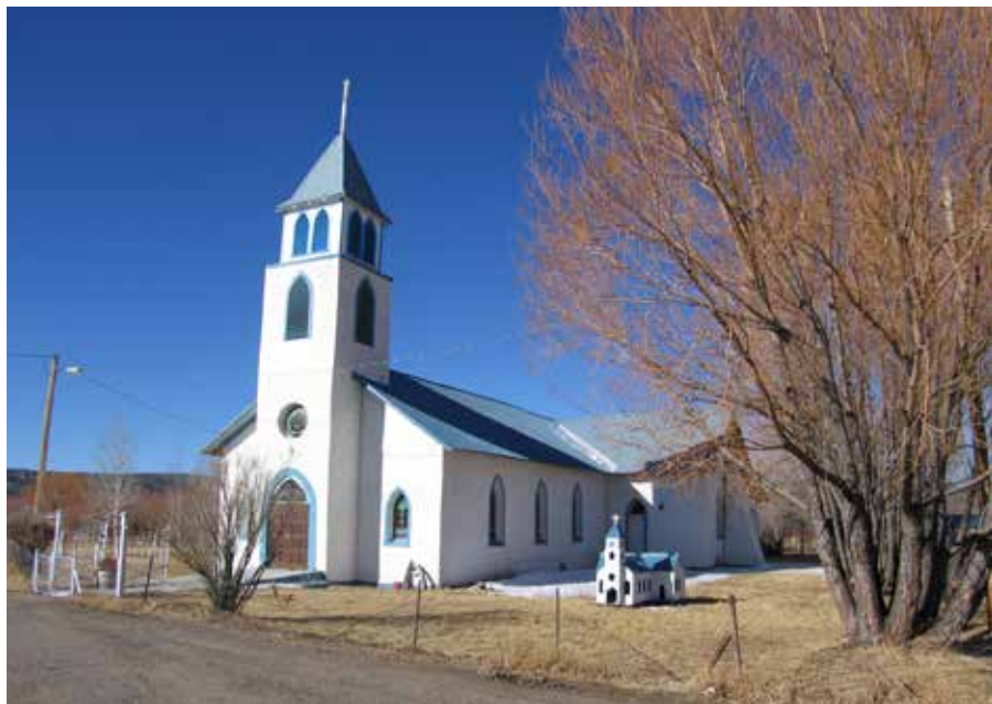
Iglesia de San Pedro y San Pablo, San Pedro