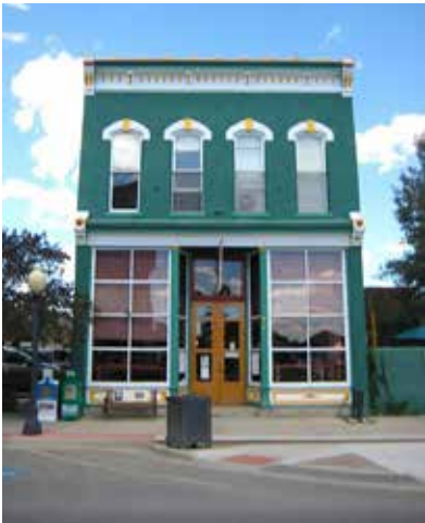
Jacobs Building, Buena Vista

In some communities, properties listed in the National Register may be automatically designated as local landmarks. Sometimes local landmark programs require approval by a local review board before changes to the property can be made. A list of Colorado communities with local landmarking programs is available at historycolorado.org .