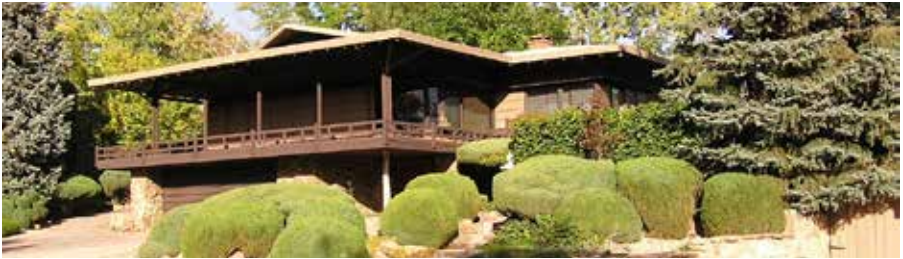
Arapahoe Acres, Englewood

The National Register of Historic Places is the official federal list of districts, sites, buildings, structures, and objects significant in American history, architecture, archaeology, engineering, and culture. Authorized under the National Historic Preservation Act of 1966, the National Register is part of a nationwide program to coordinate and support public and private efforts to identify, evaluate, and protect our historic and archaeological resources. The National Register is administered on the national level by the National Park Service. In Colorado, the program is administered by the Office of Archaeology and Historic Preservation, part of History Colorado. More than 80,000 listings from across the county make up the National Register.