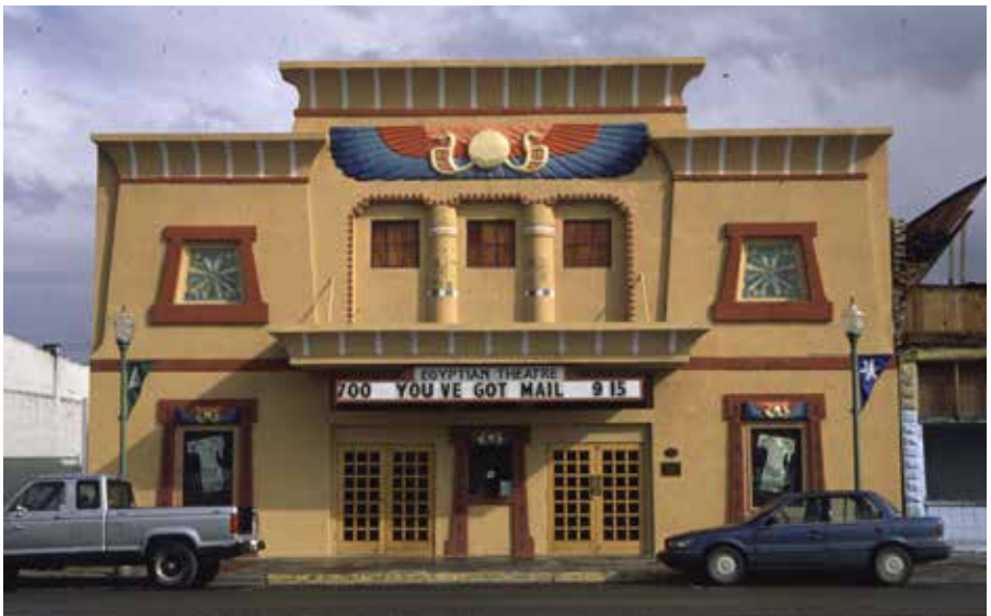
Egyptian Theatre, Delta