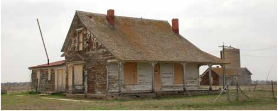
Bromley Farm/Koizuma-Hishinuma Farm, Brighton