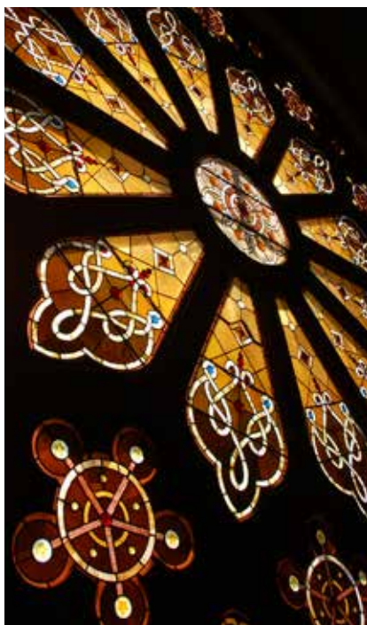
Trinity United Methodist Church, Denver

www.historycolorado.org/archaeologists/national-state-register-historic-places-how-do-i